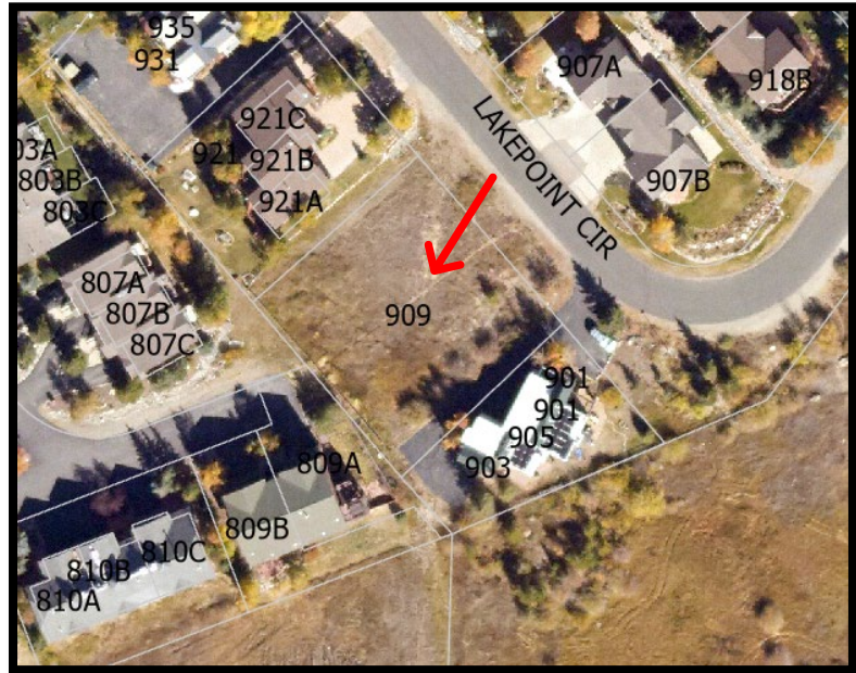
Lakepoint at Frisco PUD

The Property is located within the Lakepoint Planned Unit Development, herein referred to as the "PUD." All the surrounding properties are situated within the Planned Unit Development (PUD). The Lakepoint at Frisco PUD initially approved in 1981, encompasses a large geographic area located between North Summit Boulevard/Highway 9 and the Lake Dillon Reservoir. This PUD includes multiple commercial projects adjacent to the highway, a mixed-use project (Drake Landing), and a variety of multi-family residential projects located closer to the lake. This PUD is divided into "stages". The permitted uses and development standards for each stage are regulated by the Lakepoint at Frisco PUD Preliminary Development Plan. The Property is located in Stage 6 of the PUD, where the permitted uses are designated as residential. The current site conditions include one undeveloped lot.